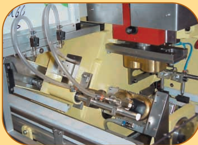
2 Cavity Die Set