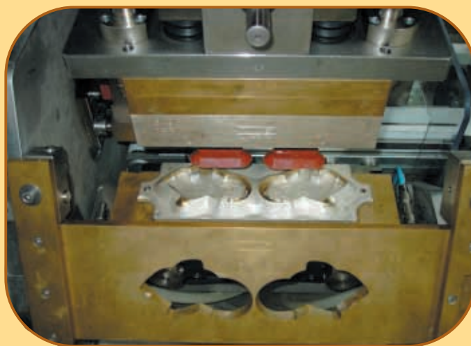
Specialty Soaps 2 Cavity Die Set