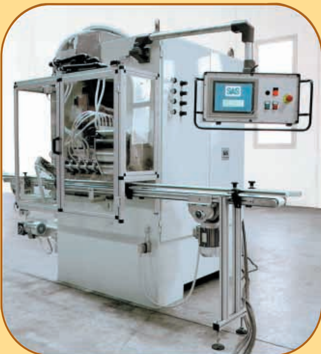
STAMPEX/6+ with side flashing discharge conveyor