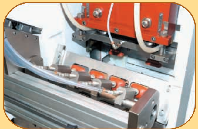
4 Cavity Die Set