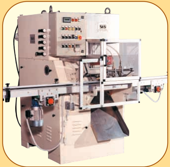
STAMPEX/4 with front flashing discharge chute