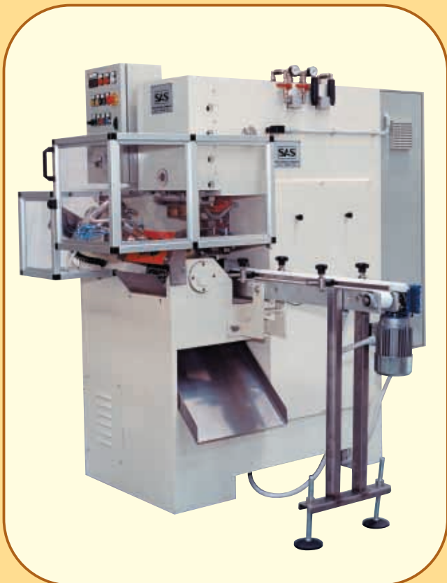
STAMPEX/2 with side flashing discharge chute