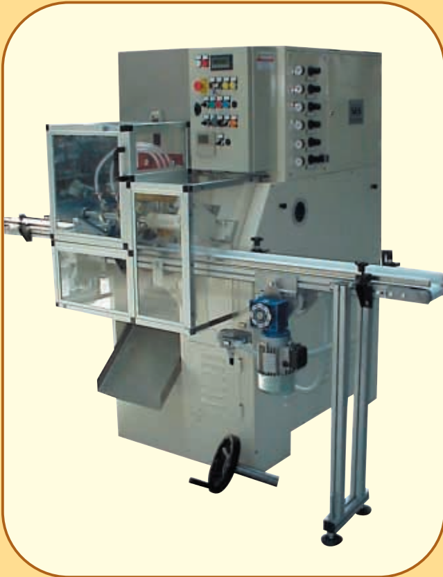
STAMPEX/3 with front flashing discharge chute