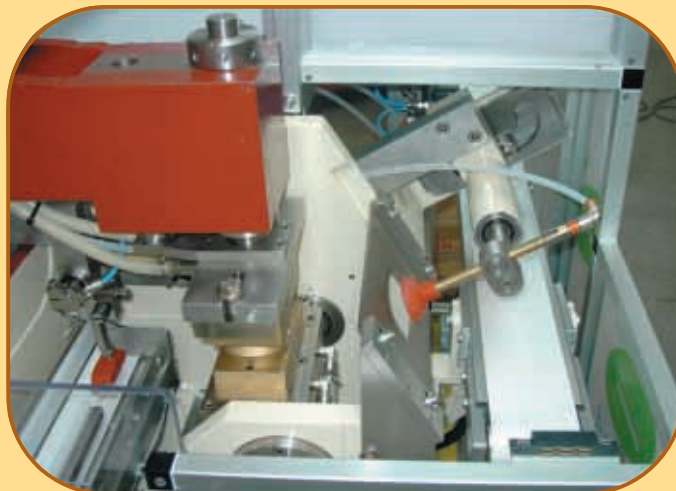
1 Cavity Die Set