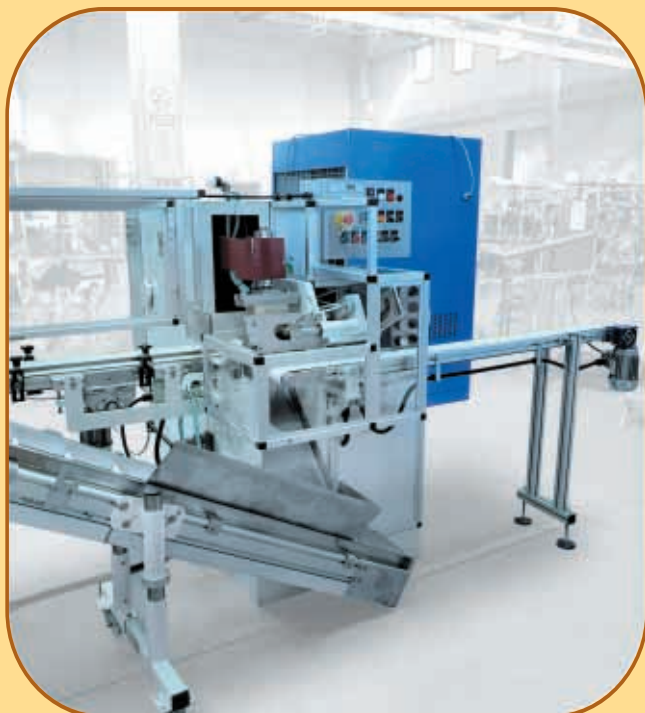
STAMPEX/1 with Die Chiller Group in the background