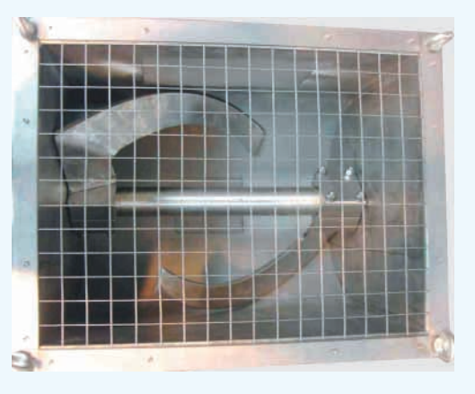
SASMIX Open Sigma (Z) Mixer Top View