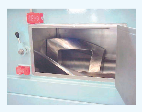
DSM Double Arm Sigma Mixer