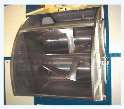
DSM Double Arm Sigma Mixer with Tilting Discharge