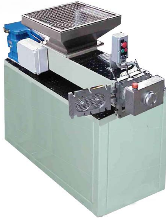
Twin-Screw Simplex Plodder